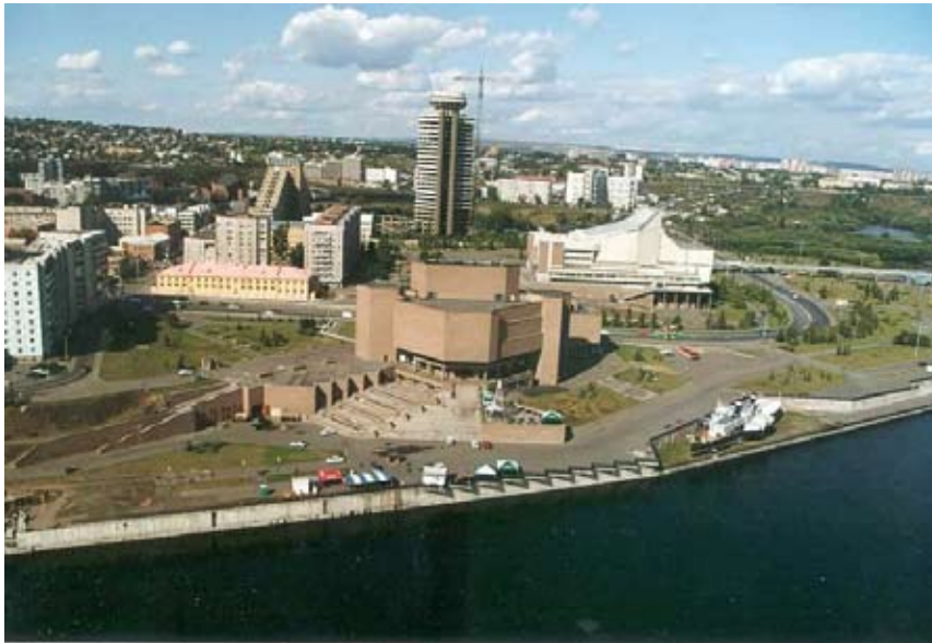
Fig. 3. A. Demirkhanov, Mira square

the architectural thought manifested in the form of assimilation of the roof slopes to the mountain ranges, the division into two volumes, the large and the small ones, thereby giving the person a choice to stay in the chamber space or be included into something more – the universal. A. Demirkhanov says the following: “The face of the city is the people’s attitude towards nature, the ability to understand the world around them. We strive to create such ensembles that have a particular Siberian character of the city so that the glass and concrete do not dominate over wildlife, but harmonize with the Yenisei banks” (Dmitrienko, 1982).